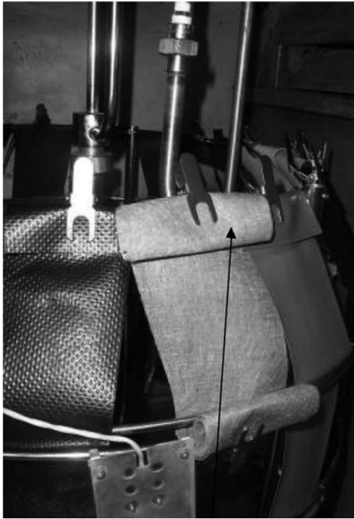
When placing specimens to be tested using roller grips in weathering device, the rolled area in the clamp needs to be protected from exposure to radiation to avoid degradation of this area (see arrow).